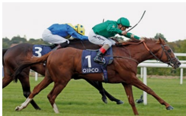
Triple Gr.1 winner Decorated Knight (Galileo) , joins an already impressive roster of stallions this season.