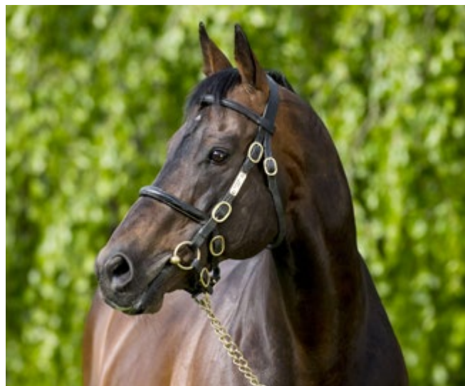
The multiple Champion sire Invincible Spirit (Green Desert) , continues to lead the way at the stud.

The stud is also home to the Living Legends , including Hurricane Fly , who holds the world record for the number of Gr.1 wins by any racehorse at 22; Gr.1 Cheltenham Gold Cup victor Kicking King ; 10-time Gr.1-winning chaser Beef Or Salmon ; dual Gr.1 Champion Hurdle winner Hardy Eustace . and Gr.1 Gold Cup hero Rite Of Passage . The on site museum houses the skeleton of Arkle , the greatest steeplechaser ever; memorabilia connected with Sea The Stars , who was bred and raised at the stud, and Gr.1 Melbourne Cup winner Vintage Crop . Along with the Japanese Gardens, the stud contains St Flachra's Garden, designed in 1999 by Martin Hallinan, commemorating the patron saint of gardeners.