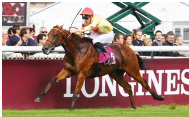
Champion French 2-y-o National Defense (Invincible Spirit) is new for 2018.

In addition to Invincible Spirit, established sires on the 2018 roster include the Gr.2 Futurity Stakes and Gr.1-placed Dragon Pulse (Kyllachy) , sire of nine-length Group winner Aethos in 2017; Elusive Pimpernel (Elusive Quality) , a multiple Stakes-producing sire in 2017 with his first Tully conceived runners, and Champion Three-Year-Old and dual Classic winner Worthadd (Dubawi) , whose first crop are three this term and whose biggest crop was born in 2017.