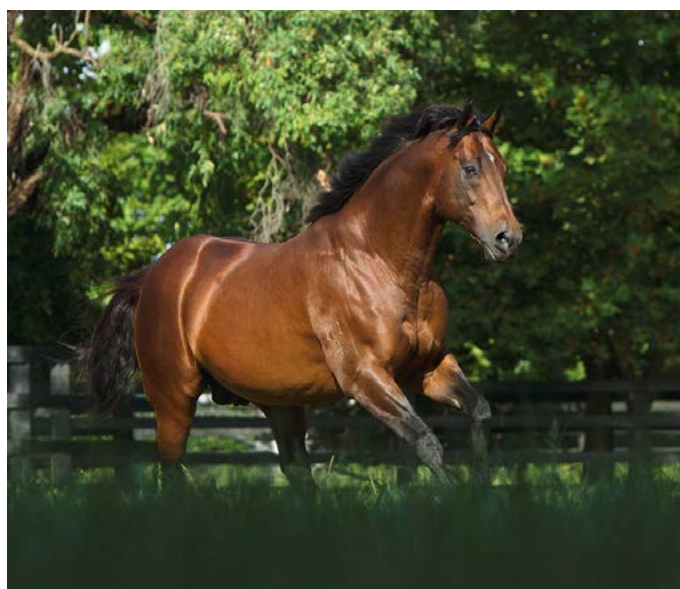
Leading sire Exceed And Excel enjoying paddock time.

His daughters are playing their part in keeping their shuttling sire at the forefront of global racing's elite. In 2016 Kuroshio's full-sister Believe'N'Succeed produced Gr.2 Futurity Stakes winner and dual Gr.1-placed juvenile Anthony Van Dyck , while Gr.1 Middle Park Stakes hero Ten Sovereigns is out of the Listed-placed Exceed And Excel mare Seeking Solace . Both are