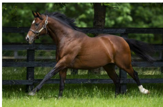
Gr.1 winner Free Eagle (High Chaparral) will have his first runners this year.