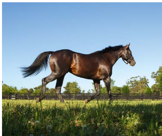
Kuroshio (Exceed And Excel) returns to the northern hemisphere to stand for Compas Stallions after the success of his first crop.