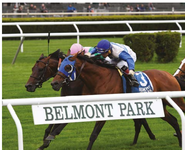
Smooth Daddy (Scat Daddy) [blue cap] defeats the high-class Time Test in the Gr.3 Fort Marcy Stakes at Belmont Park.

Winner of the Gr.2 McEwan Stakes over 1000m as a three-year-old, having taken the 1100m Gr.3 Blue Diamond Prelude as a juvenile, Kuroshio is a full-brother to the Gr.3 winner Believe'N'Succeed , who has produced the Gr.2 Futurity Stakes winner Anthony Van Dyck , and the Champion New Zealand Sprinter Bounding (Lonhro) . His winning Gone West dam Arctic Drift is a daughter of the Gr.1 Alabama Stakes and Gr.1 Test Stakes winner November Snow (Storm Cat) . Another half-sister to Arctic Drift is responsible for the Gr.1-winning sire Morning Line .