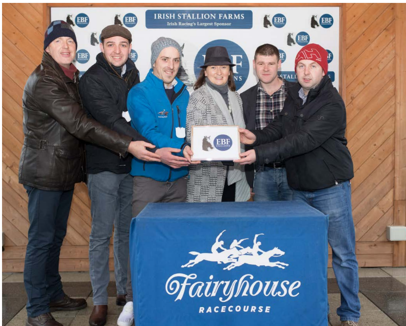
Youcantcallherthat wins the Irish Stallion Farms EBF Mares Handicap chase for the Lostwelton Syndicate.