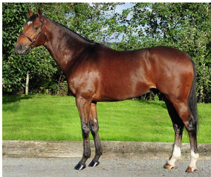
Coolagown Stud's striking Shantaram (Galileo) who has his first runners this year.