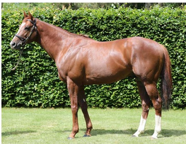
Triple Gr.1 winner Decorated Knight (Galileo) , whose first foals will be on the ground this spring.

Established sires on this year's roster include the dual Pattern winner Dragon Pulse (Kyllachy) , sire of ten Stakes horses to date, along with the dual Gr.3 winner Elusive Pimpernel (Elusive Quality) , who has sired five Stakes horses at a minimal fee, as well as several promising young National Hunt horses.