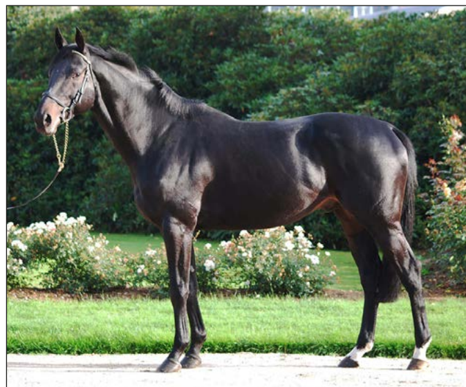
Coolagown Stud's new stallion for 2019 Axxos (Monsun) will be on show during the ITM Stallion Trail.