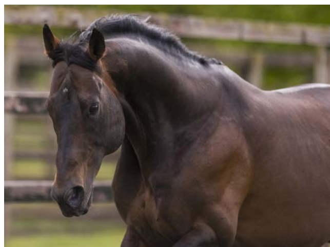
Multiple Champion sire Invincible Spirit (Green Desert) remains the star of the stud.

The stud is also home to the Living Legends , including Hurricane Fly , who holds the world record for the number of Gr.1 wins by any racehorse at 22; Gr.1 Cheltenham Gold Cup victor Kicking King ; ten-time Gr.1-winning chaser Beef Or Salmon ; dual Gr.1 Champion Hurdle winner Hardy Eustace and Gr.1 Gold Cup hero Rite Of Passage . The on-site museum houses the skeleton of Arkle , the greatest steeplechaser ever; memorabilia connected with Sea The Stars , who was bred and raised at the stud, and Gr.1 Melbourne Cup winner Vintage Crop . Along with the Japanese Gardens, the stud contains St Flachra's Garden, designed in 1999 by Martin Hallinan, commemorating the patron saint of gardeners.