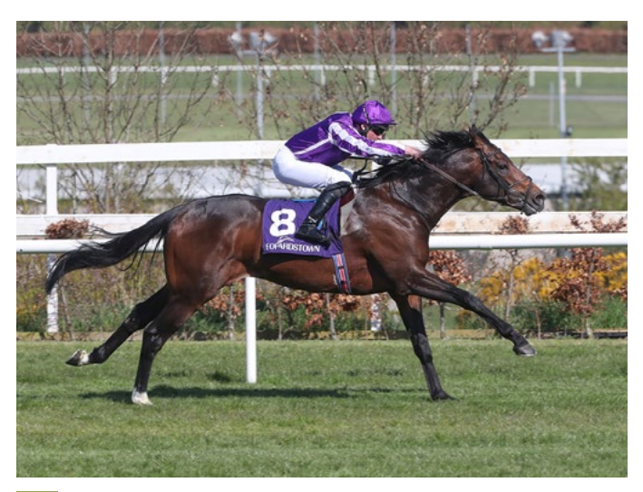
Lope Y Fernandez ( Lope De Vega) saw out the trip well to land the Listed Heritage Stakes over 1m at Leopardstown yesterday.