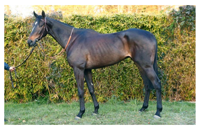
Goas Mat ( Racinger ), who will be offered by Auctav on Friday.

Auctav is hosting a flash sale on Friday, 16th April, when it will offer just one lot.