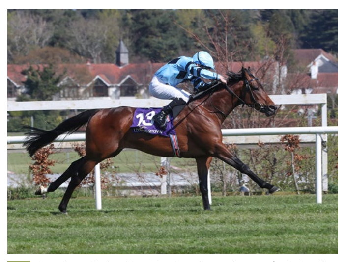
Southern Lights ( Sea The Stars) won the 1m2f colts' and geldings' maiden in taking fashion.

Ownwan has a two-year-old filly named Family Star by Sea The Stars and a yearling filly by Australia .