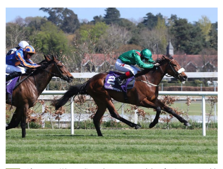
Alazenya ( Siyouni) made a winning debut for Dermot Weld and The Aga Khan in the 1m2f EBF fillies' maiden at Leopardstown yesterday.

( Spinning World ). Also the second dam of two Stakes winners abroad, Aliya is a half-sister to Listed winners Aliyoun ( Kalamoun ) and the Gr.1 Irish Oaks runner-up Aliysa ( Darshaan ; dam of Gr.3 winner and sire Desert Story ) as well as to the winning Shahrastani mare Alaiyda , dam of dual Gr.1 winner and sire Alamshar and grandam of Gr.3 winners Alayan and Flowers Of Spring . The third dam is the French Listed winner Alannya ( Relko ).