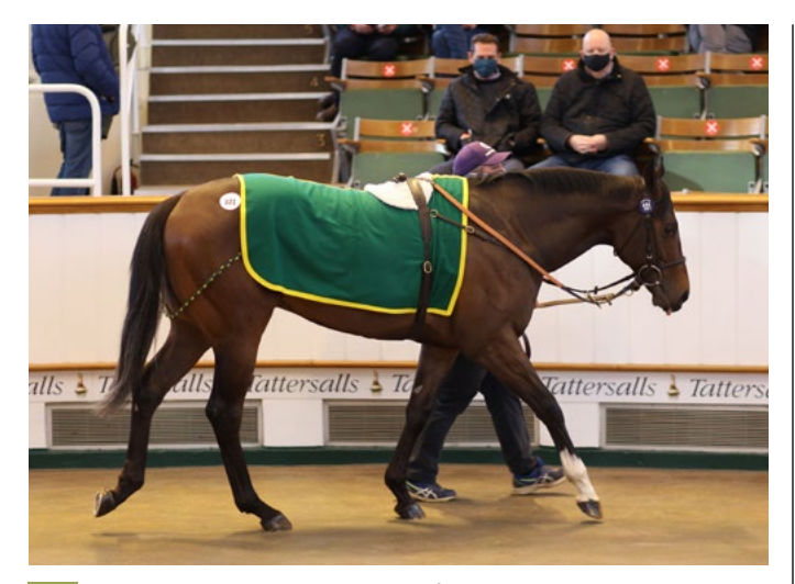
Lot 101 , the Showcasing colt from Greenhills Farm, who was bought for 150,000gns by Stephen Hillen Bloodstock.

while they will train plenty of winners at that venue, there will be a share of losers too.