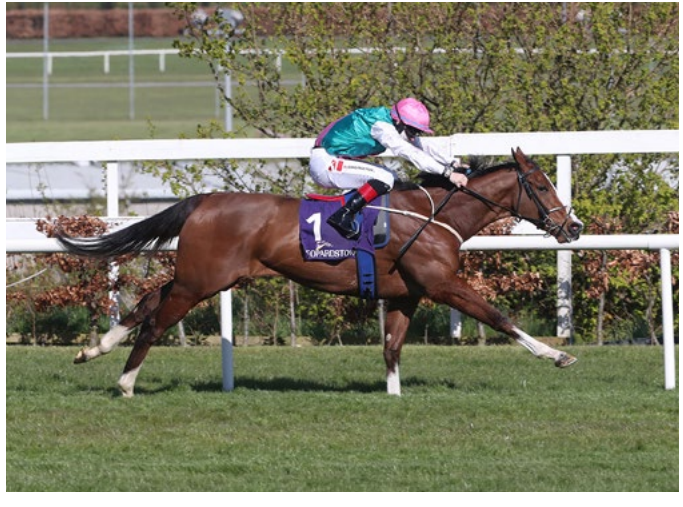
Acanella ( Dansili) won the fillies' maiden over a mile at Leopardstown.

She is the second foal and first winner out of Across The Floor ( Oasis Dream ), a once-raced half-sister to five-time Gr.1 winner and sire Flintshire ( Dansili ), the Gr.2-placed Listed winner Dance Moves ( Dansili ) and the dam of Gr.2 winners Projected ( Showcasing ) and Headman ( Kingman ). The second dam is the Sadler's Wells mare Dance Routine , winner of the Gr.2 Prix de Royallieu and the Gr.3 Prix de Royaumont and second in the Gr.1 Prix de Diane. The third dam Apogee ( Shirley Heights ) also won the Gr.3 Prix de Royaumont and her nine winners from ten foals also include dual Gr.3 winner and sire Apsis ( Barathea ) and Listed winners Space Quest ( Rainbow Quest ; dam of Listed