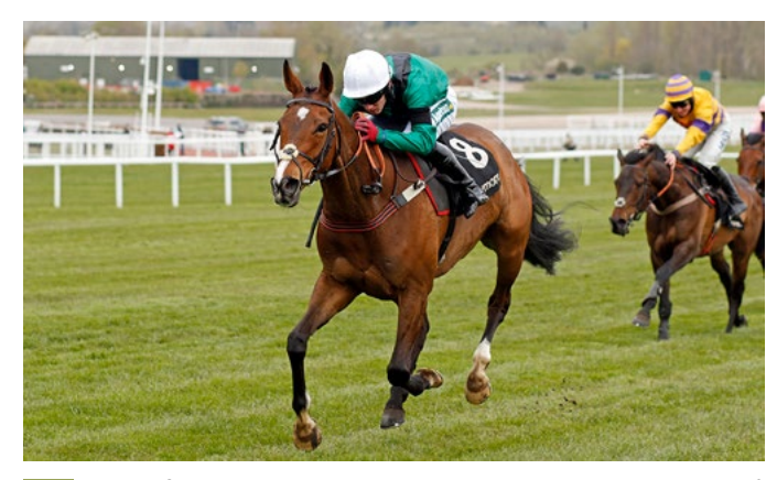
Manofthemountain ( Mahler) was the impressive winner of the Gr.2 Silver Trophy Handicap Chase at Cheltenham yesterday.

at the Goffs Land Rover Sale. The eight-year-old is a full-brother to the bumper and hurdles winner Battle Of Midway and a half-brother to Fact Of The Matter ( Brian Boru ), whose biggest victory came in a cross-country chase at Cheltenham. Their dam, a daughter of Presenting , ran once and is from the family of the Gr.2-winning hurdler and chaser Mister Fisher ( Jeremy ).