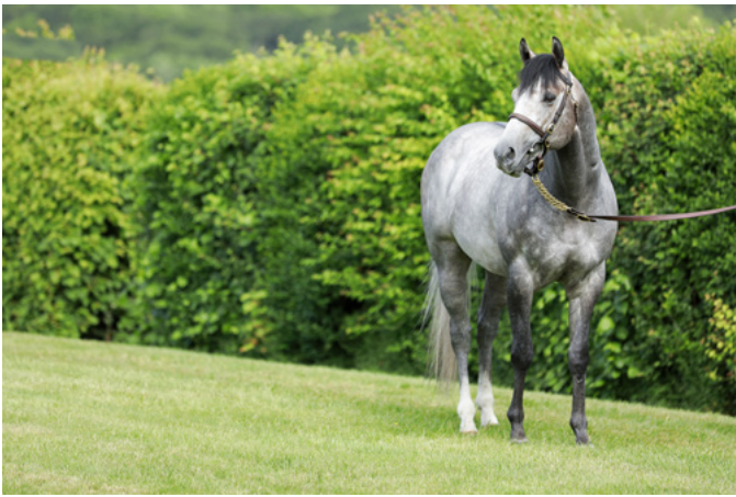
Whitsbury Manor's Havana Grey (Havana Gold) earned the British EBF Stallion Special Merit Award for 2023.