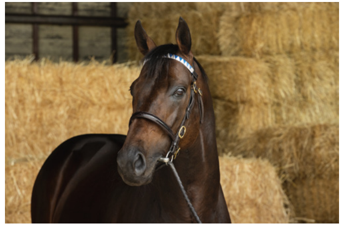
Darley's Too Darn Hot (Dubawi) was awarded the Tattersalls Silver Salver award in the 2023 TBA Statistical Awards.

The leading British-based stallion by Flat winners, the Barleythorpe Stud Silver Cup, went to Kingman who was represented on the track last year by over 100 winners, including