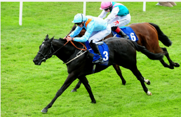
Gr.3 Anglesey Stakes of 63 yards in 1.15.27